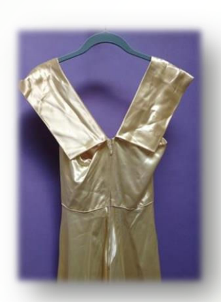
Yellowed Dress stored in plastic bag

It is important to note that one of the leading causes of bridal gown yellowing is the plastic bags that many brides keep their gowns in. Most plastics give off damaging fumes that actually promote yellowing. But, even with proper care, some fabrics will yellow more than others and it may be <u>impossible</u> to prevent all yellowing.