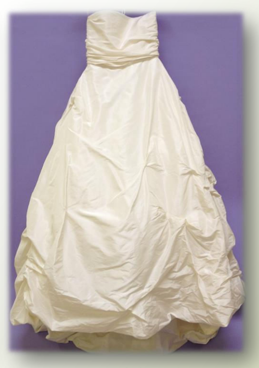
Here is a sad case of how an inexperienced dry cleaner damaged this beautiful couture gown.