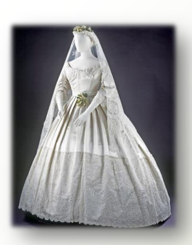
Victorian Wedding Dress Victoria and Albert Museum

Garment preservation at the Smithsonian Institute in Washington D.C. is similar. Heirloom garments that are not currently on display are cleaned and carefully stored in climate controlled conditions. Many dresses are hung on padded hangers, while some garments are laid in drawers or acid free boxes with acid free tissue. Sharp creases are avoided, as they can damage fabric. To keep the folds from becoming permanent creases, the garments stored in boxes or drawers are refolded into a different position every few years.