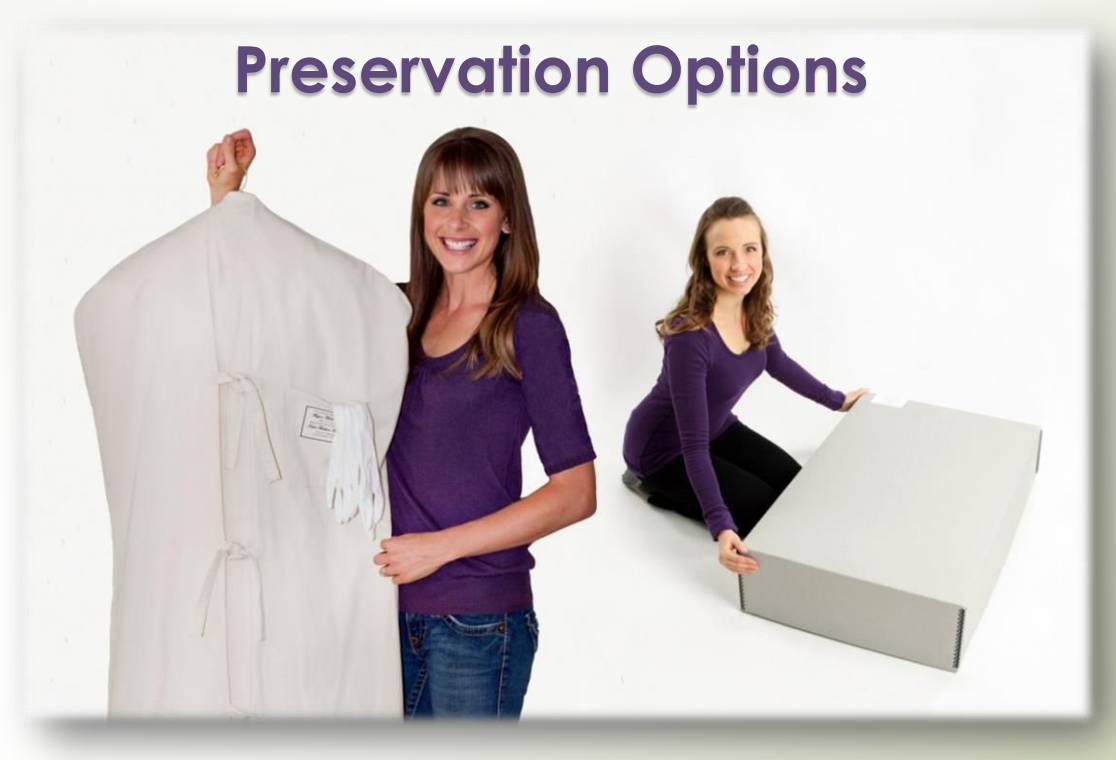
Museum Method (Hanging)