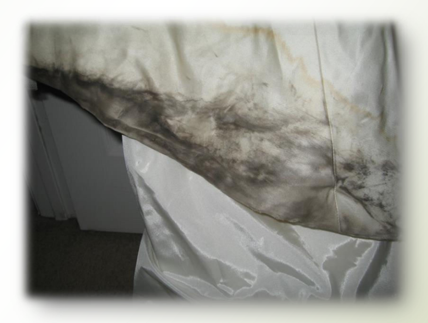
This gown was neglected and not properly cared for.

Cleaning and preserving your bridal gown as soon as possible ensures that your gown remains in the best condition possible. Ideally, your dress should be cleaned and preserved within days or weeks of your wedding.